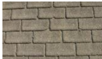
Roof in need of repair.

foundation; as well as a thorough inspection of the air conditioning system.