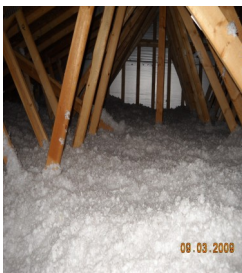
Plenty of Insulation found in this attic.

Air moves in and out of your home through every nook and cranny it can find. The majority of the air escapes through the ceilings, walls and floors of your home.