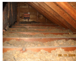
Lack of Insulation, recommend adding some for added comfort and lower utility bills.

space is blocked. A vapor retarder should be installed on the ground to reduce moisture migration into the crawl space.